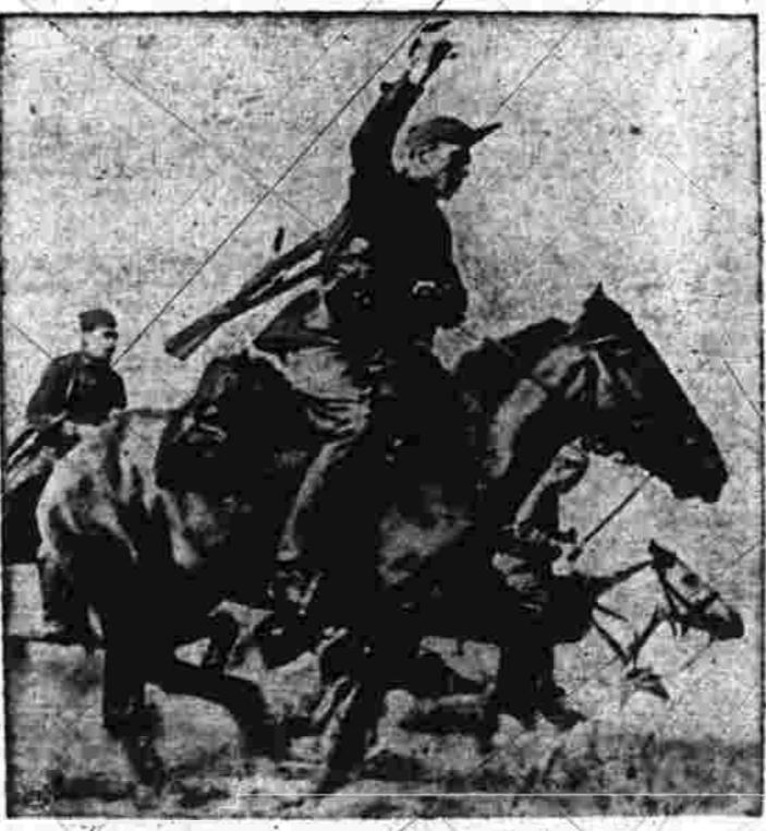
The mechanized Germans who found the famed Polish cavalry such a soft touch are turning into a horse of a different color in Russia. The Soviet claim the Red horsemen are getting in telling blows against the invader. New picture shows Russian cavalry thundering to the attack according to Moscow caption.